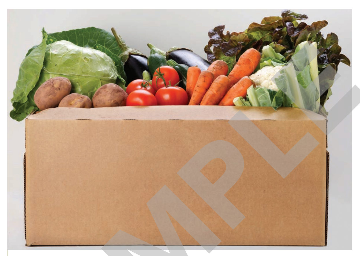
Delivery of organic vegetables ready for checking