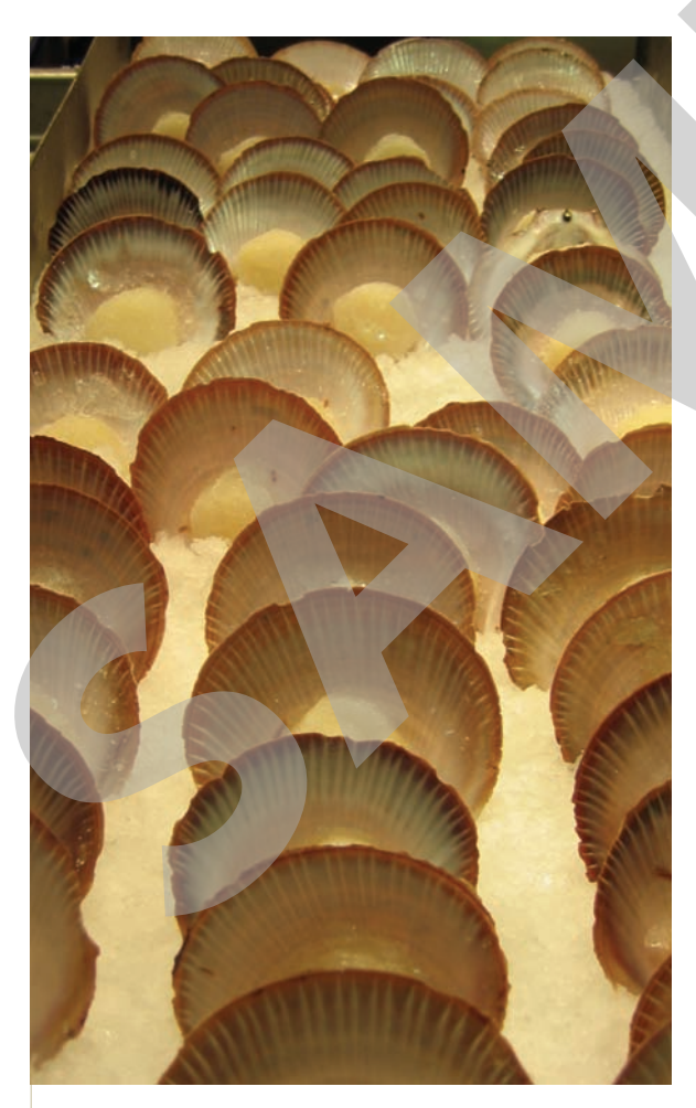
Scallops displayed for purchase

Basic knowledge of product shelf life is important for identifying correct storage requirements. For example, when dry goods are opened they should be stored in containers with tight-fitting lids that have a low moisture content to reduce the possible infestation from rodents, weevils and other insects. Supply levels of stock should be carefully monitored so stock can be reordered and rotated as needed and discarded when it becomes stale or has deteriorated.