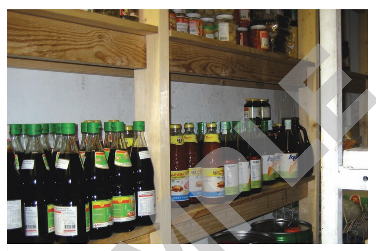
Each food category has specific storage requirements