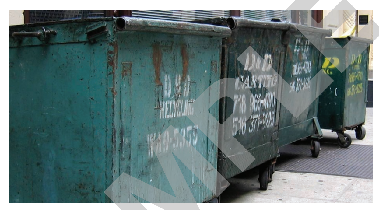
Correct disposal of waste reduces the incidence of vermin and pests

cleaning chemicals, out-of-date products helps to avoid incidence of vermin and pests. Where possible, goods should be recycled to help reduce waste and protect the environment. For more specific information on waste disposal see Unit 5.