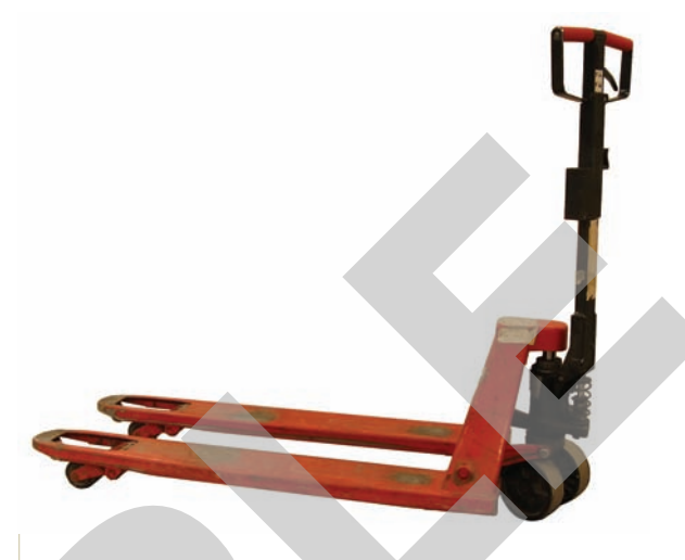
Use trolleys to carry heavy loads

All Australian workplaces are covered by legislation that defines employer and employee responsibilities for OH&S requirements. In addition, most workplaces have an OH&S policy and code of practice that aims to reduce the incidence of illness and injury within the workplace. Many injuries occur when stock is delivered and being put away. To reduce the incidence of injuries, the following should be observed.