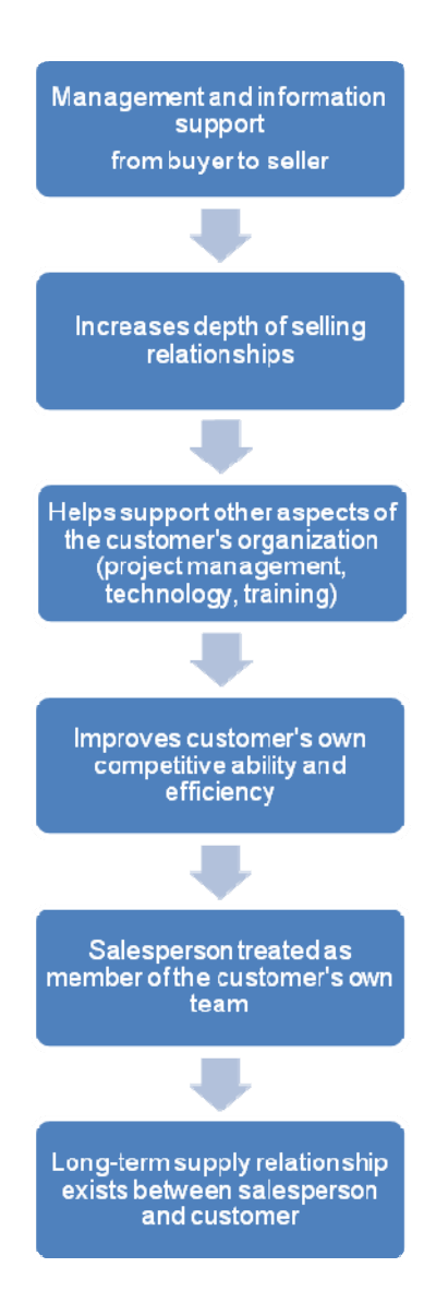
Figure 2: Impact of Value Added Sales Relationships