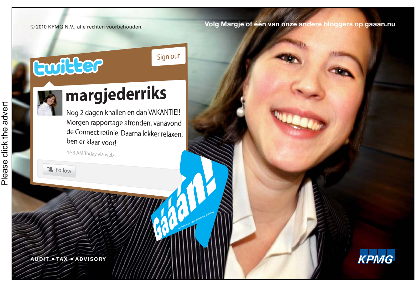
Download free books at BookBooN.com

Customers may tell you directly why they are objecting, but they might not. They might try to be polite or evasive, or they simply might not be comfortable expressing themselves directly. So it will be your job to explore the objection in order to get to the root of it. You will need to listen to the client – both to what is being said and what is not being said.