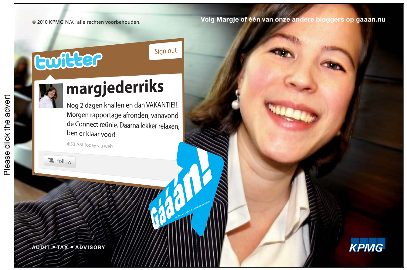
Download free ebooks at BookBooN.com

So instead, start by examining the employee's performance against each measure you've established. Only after you have established what you believe is a fair rating for each criteria should you consider comparing employee performance between employees that have the same job description. And you should only make a comparison between one criterion at a time – not between the employees as a whole.