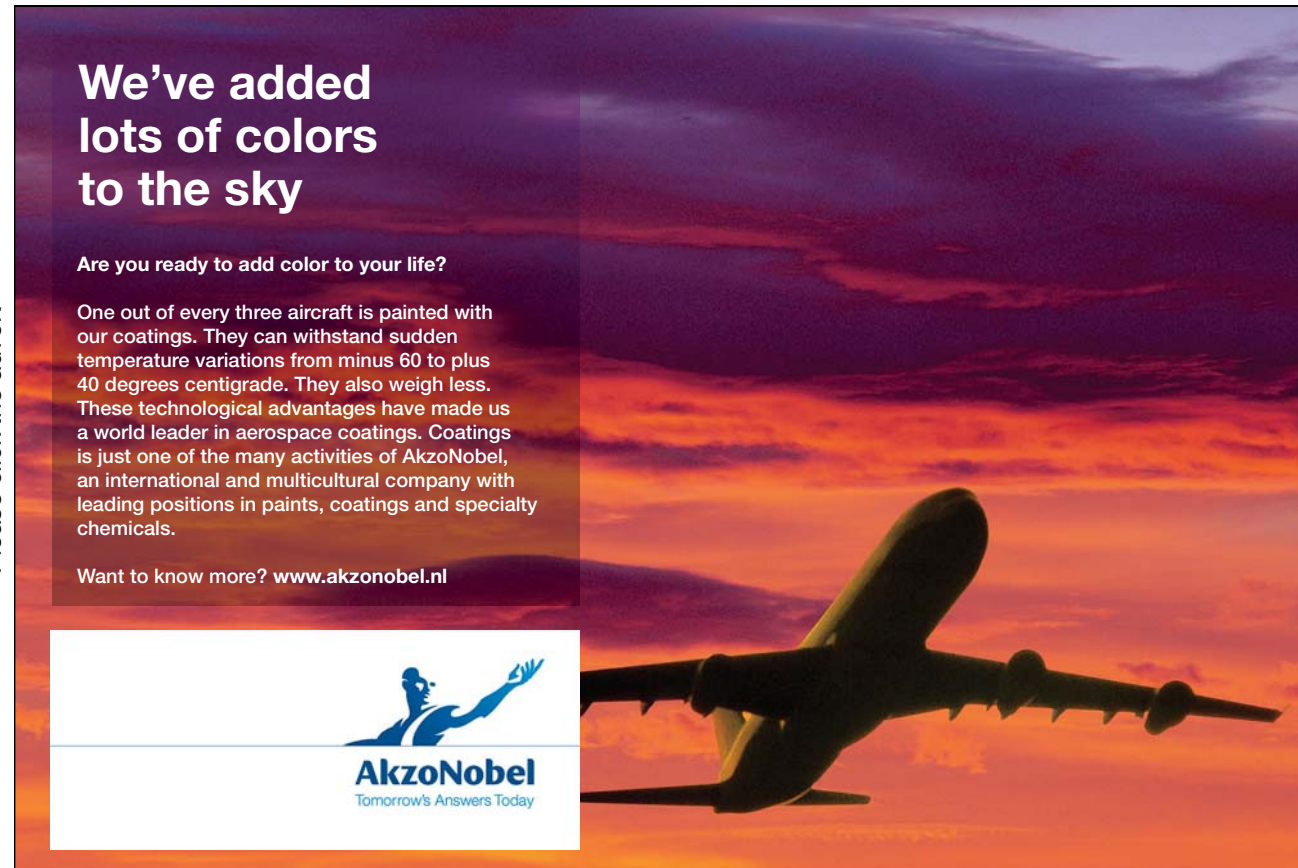
Download free ebooks at BookBooN.com

However, there is a right way and a wrong way to set goals. Well-set goals are clear and you can objectively determine whether or not the goal has been reached. Poorly set goals are not clear and you can't necessarily tell what it will look like once the goal has been achieved. The result is frustration and lack of effectiveness. We'll now look at two methods for goal setting that you can use in performance management and that you will then use for running effective appraisals when the time has come.