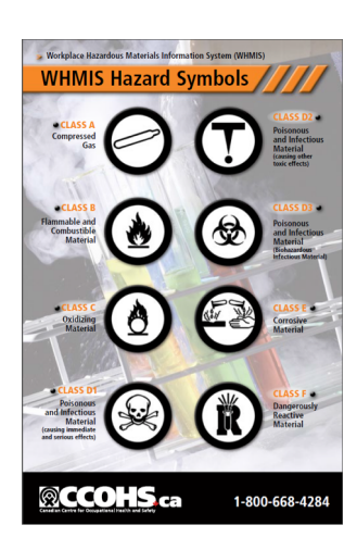
Figure 1. WHMIS 1988 classes and symbols

WHMIS defines a hazardous or controlled product as a pure substance or mixture that meets or exceeds criteria for inclusion in one or more of the WHMIS hazard classes. The six classes and eight hazard symbols from WHIMS 1988 are shown in Figure 1, and the symbols from the WHMIS 2015 program, which uses the GHS, are included in Figure 2. The appropriate symbol must appear on the applicable supplier labels.