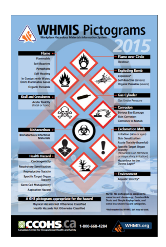
Figure 2. WHMIS 2015 classes and symbols