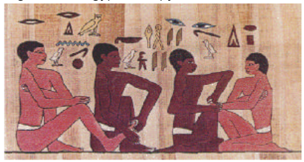
Figure 1-1 - Egyptian Papyrus

A hand chart as shown in Figure 1-2, from India (circa 1900), depicts the zones which are known as cross-points of the cosmos and also as chakras.