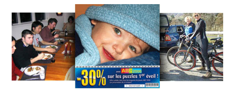
Photo prints • An interesting idea that's been put on hold after an apparently too-successful launch: French MesPhotosOffertes offered free picture processing and home delivery in exchange for ads on the bottom of pictures. Up to 20 pics could be uploaded at a time, which resulted in 11 x 15 cm prints, with a 4x15 cm (tear-off) bottom strip containing ads. A FREE LOVE idea waiting to be picked up by a perhaps bigger player in this field?