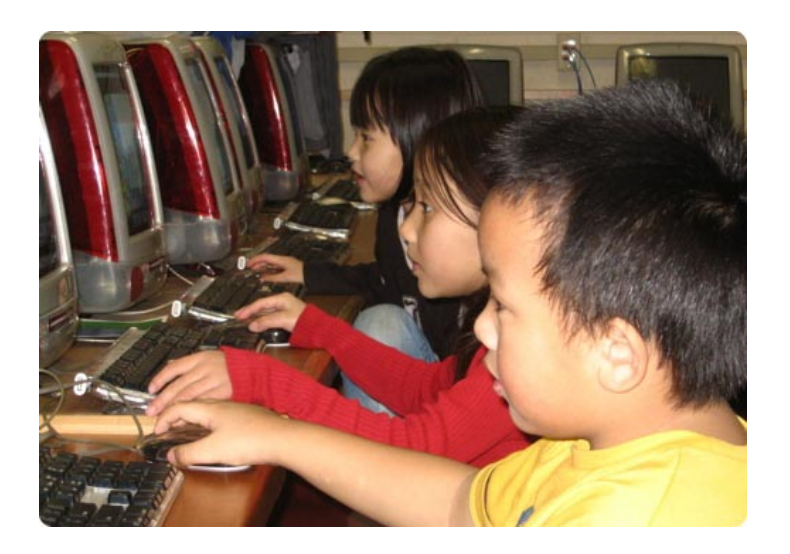
FREE LOVE generation

Rest assured that we will see a constant shift towards new, innovative business concepts and marketing tactics that make the most of FREE LOVE, online and offline, just because they can. There's a demographic twist to it, too: with younger generations now growing up expecting plenty of goods and services to be low-cost, partially free, or indeed completely free, FREE LOVE will continue to expand for many years. With it, the perception of free as having no value will eventually die out.