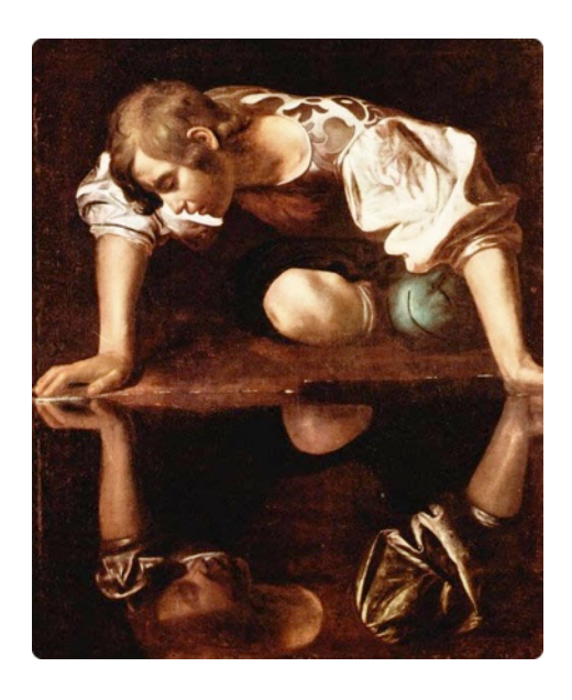
Give and be seen

If giving is the new taking, then hundreds of thousands consumers/individuals are on the right path. Never before have we witnessed such an explosion of free content, courtesy of individuals who—for free, nada, zilch—are happy to share their thinking, their novels, their photos, their movies, their music, their knowledge and expertise, their advice, their crafts and more.